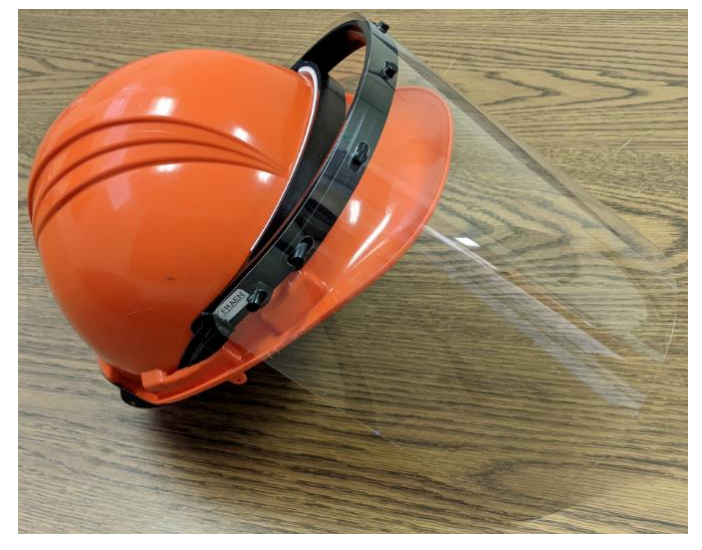
May attach directly to hard hat (not included)